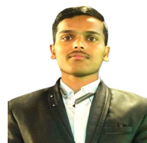
Programme Officer (WASH)