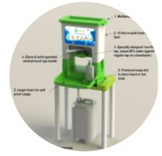
Health & Hygiene