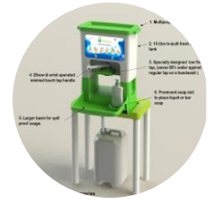
Health & Hygiene