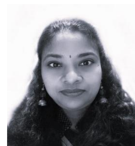
State Lead ( West Bengal)